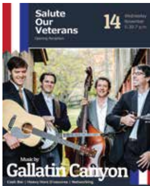
Wednesday November, 14 5:30-7 p.m.

The opening reception, Salute our Veterans, will begin at 5:30 p.m. in the Exhibit Hall (Independence Center).